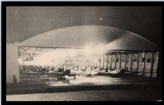
BFTS #3 hangar, Miami, OK 1941