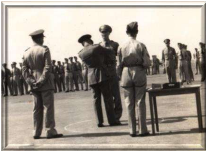
Col. Gail Halvorsen