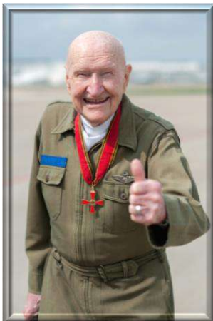
Col. Gail Halvorsen