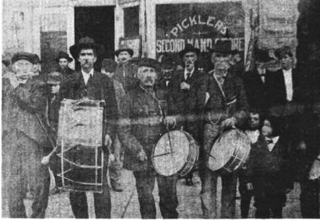
GAR MEMBERS, with drum and fife, were getting ready for a Memorial Day parade in downtown Miami, possibly about 1919. The Ottawa County Historical Museum would welcome identification of the old soldiers and others in the picture.