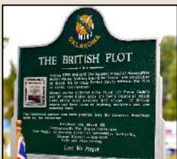
State of Oklahoma Historical Marker