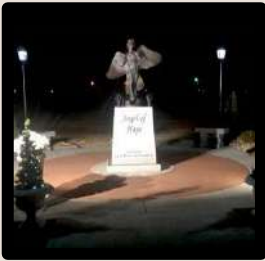
Angel of Hope Candlelight Remembrance Ceremony December 6 th , at 7:00 p.m., at G.A.R. Cemetery

Scouts and volunteers come to G.A.R. each year on the Saturday before Memorial Day to set flags by as many Veteran's markers as possible.