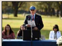
British Flyers Remembrance Ceremony