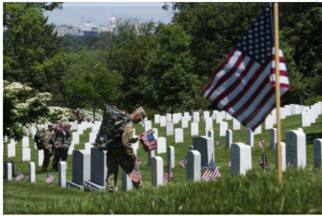
Arlington Cemetery: A year in pictures