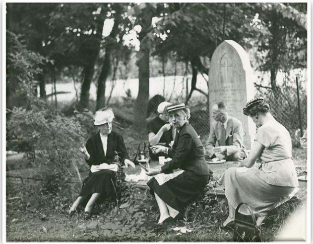
Picnicking in the Cemetery