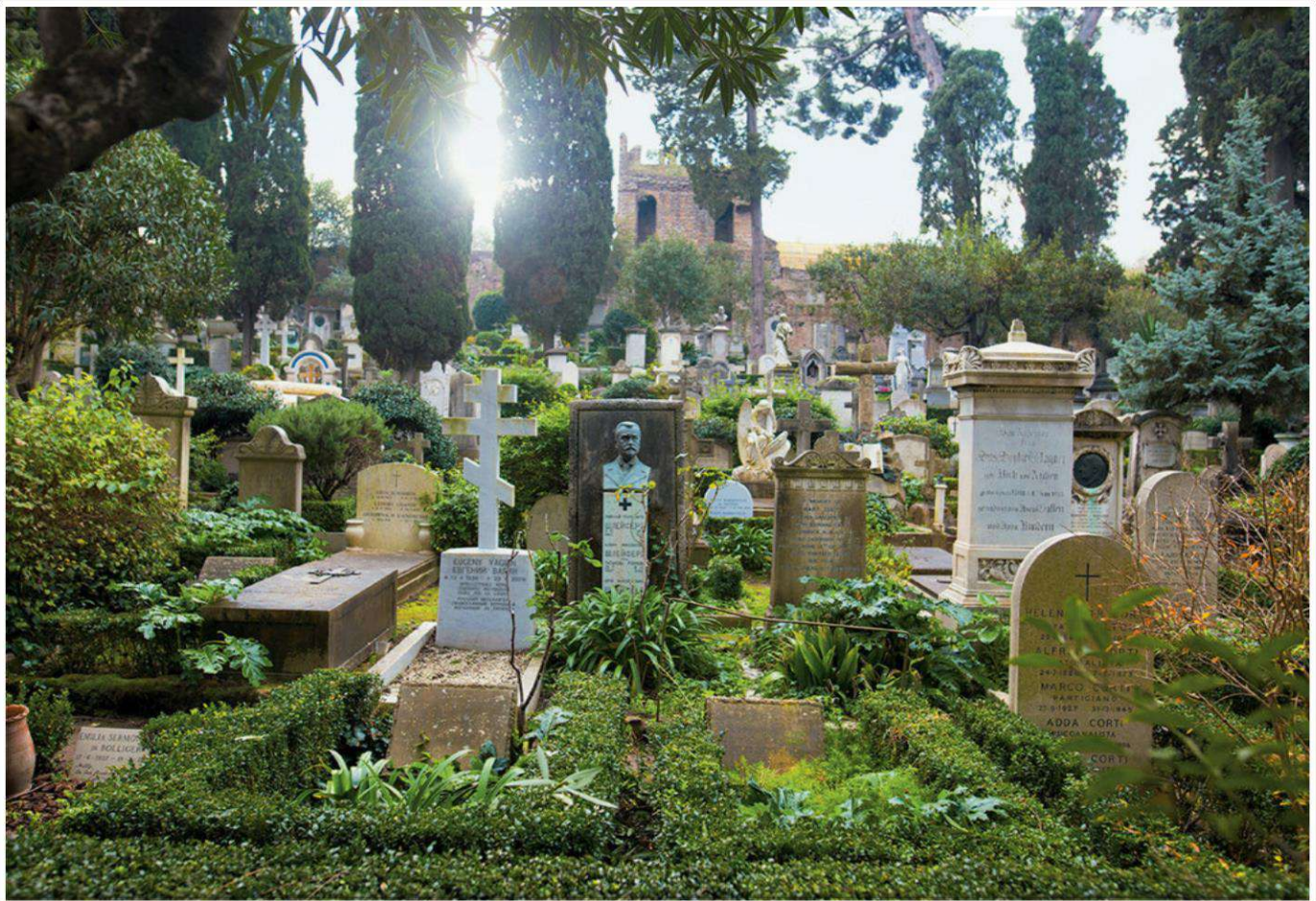
In Search of Cemeteries Alive with Beauty, Art, and History